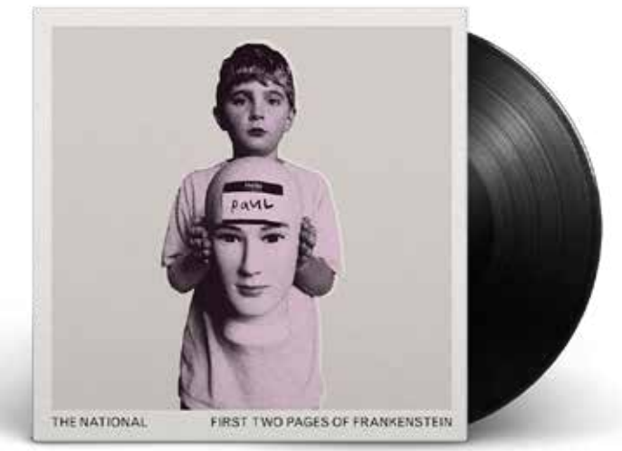
The band 'The National' filmed a promotional video on the Bearsville Theater stage for their new album 'The First Two Pages of Frankenstein'